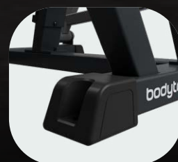
Rubber bumpers in the bases