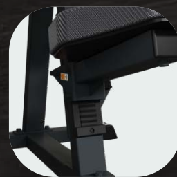
Adjustable seats at different heights