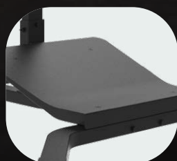
Platforms and footrests non-slip