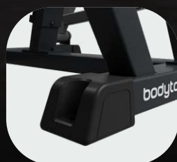
Rubber bumpers in the bases