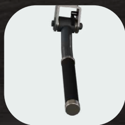
Non-slip grips with PVC cover