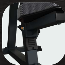
Adjustable seats at different heights