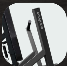
Convergent independent motion